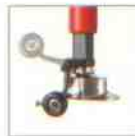
Mechanical bead press roller