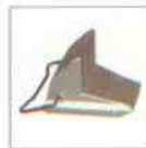
Set of adaptors to reduce outside clamping diameter by 2 inches