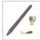
Universal quick change device for tool-heads