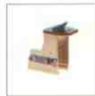
Set of adaptors to reduce outside clamping diameter by 4 inches