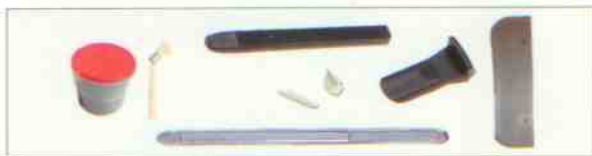
Tire paste, paste brush, bead lever and kit of plastic protectors for alloy rims