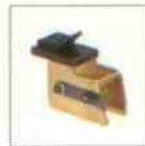
Set of adaptors to increase outside clamping diameter by 4 inches