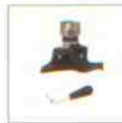
Polymer mount/demount head