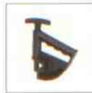
Drop-center mounting clamp