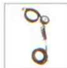
ASTURO tire inflating gun-&gauge (CE norms)