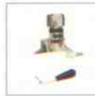
Mount/demount head for convex-spoke rims (VW) complete with polymer inserts to protect alloy rims

For other accessories see separate catalog.