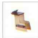
Set of motorcycle wheel adaptors